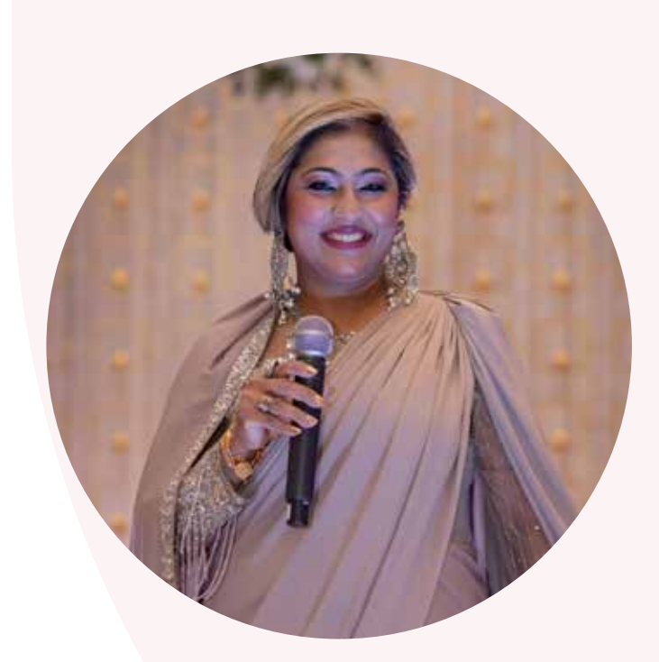
The team at Rain71 Technology understood our vision and

Logo Design Create a memorable brand identity. Salon Menus & Flyers Professionally designed marketing materials. Video Content Showcase transformations and promotions.